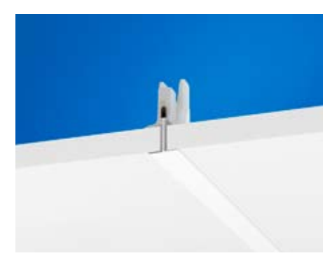
Hygiene Protec A C3 section with Connect Hygiene clip 20