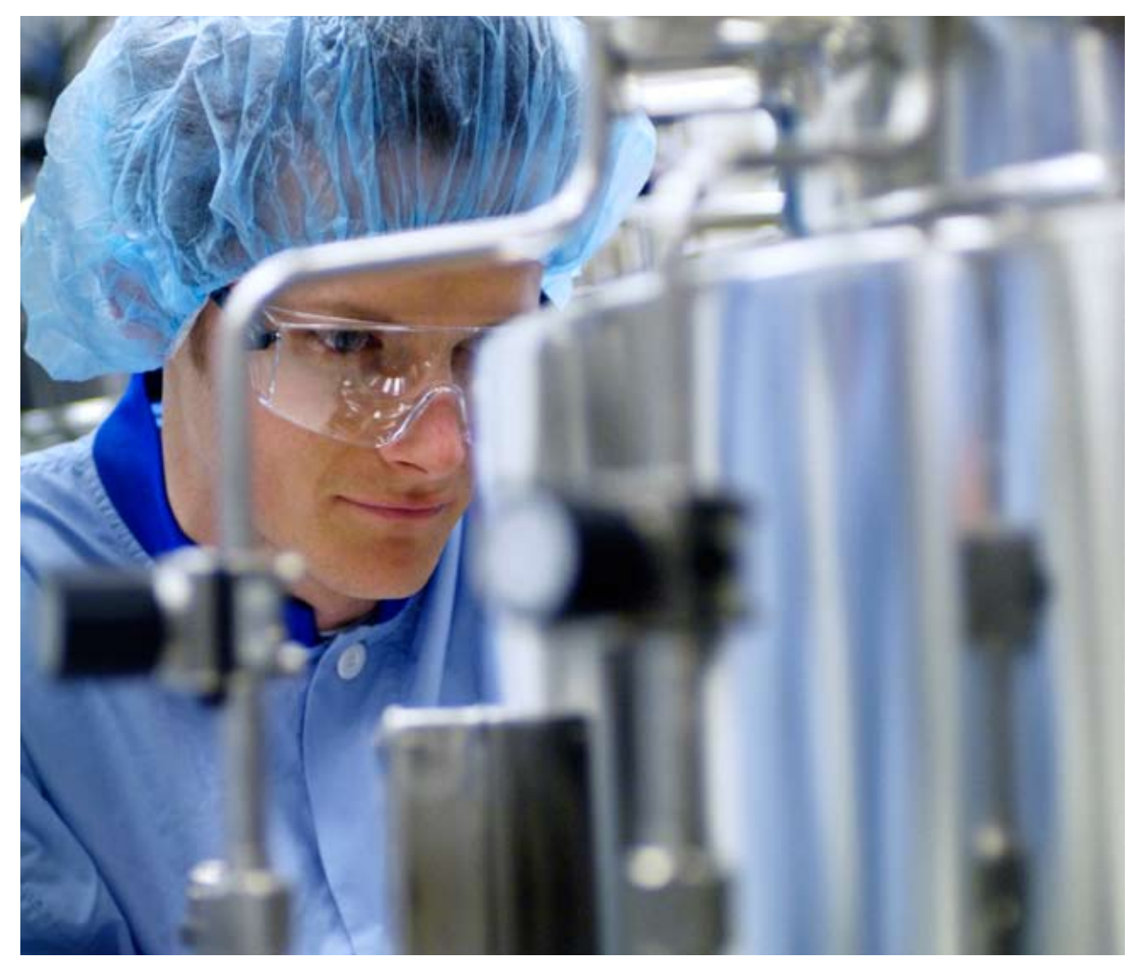
Less noise creates a calm, pleasant atmosphere, making employees more alert and focused.