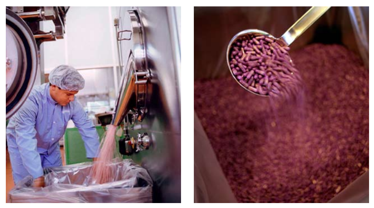
Different rooms in a facility have different hygiene requirements.