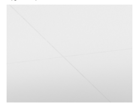
Hygiene Labotec Ds C1 system