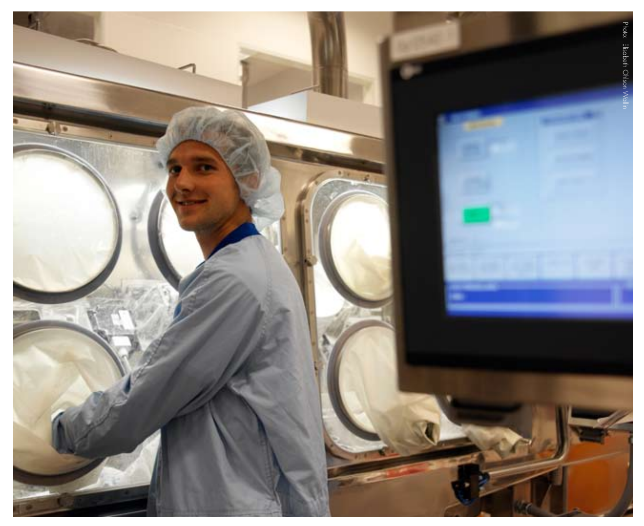
All products and systems installed in pharmaceutical industry must comply with GMP classifications.