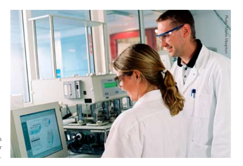
A good sound environment provides better conditions for teamwork and easier communication.