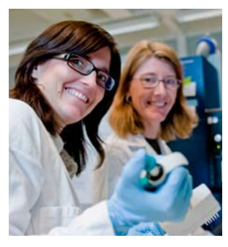
Less noise offers benefits in terms of better teamwork and easier communication.

Sound affects us in many ways. Disturbing noise causes fatigue, stress and communication problems. This impairs both productivity and safety, which in turn reduces profitability and can violate work environment regulations. Sick leave and high staff turnover also impact negatively on profitability. There is much to be gained from achieving an optimal acoustic environment.