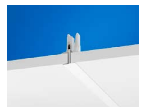
Hygiene Advance A C3 section with Connect Hygiene clip 20